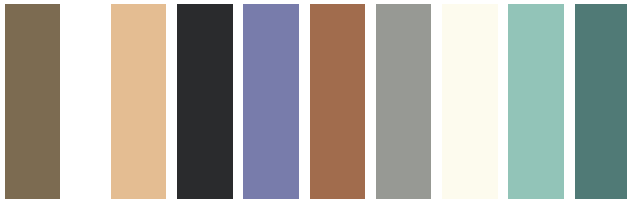
BB AMB BLK BVT BTN GRY HWT SGR TEL